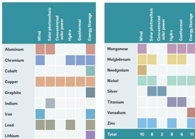
Figure ES-1. Overview of metals needed for renewable energy technologies

The transition away from fossil-fuel-based energy and toward renewable energy sources will lead to a greater need for many metals, including those commonly used in construction and electrical wiring (e.g., copper and aluminum) and those primarily used in creating renewable energy technologies such as wind and solar (e.g., lithium and cobalt). The metals of relevance for different renewable energy technologies are shown in Figure ES-1.