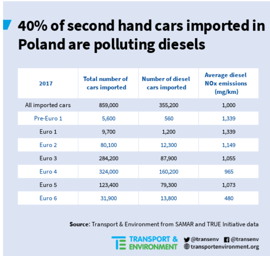
Figure 1 - Number of second-hand cars imported in Poland in 2017 per Euro class including the average NOx emissions

Poland has some of the worst air pollution in Europe causing over 43,000 premature deaths annually. 8 The European Court of Justice ruled against Poland this year for failure to reach the 2008 emission limits for carcinogenic particles. 9 The graph below summarises the numbers of diesels that are being imported into Poland and the toxic pollution they bring.